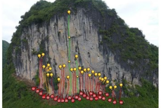
Rock Climbing Town in Guling Town